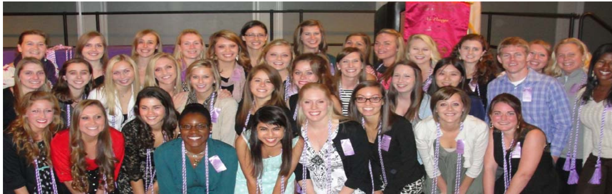
Prelicensure Inductees (pictured above):

Congratulations to the following students and nurse leaders for their Nov. 1 induction into the Nu Omega Chapter of Sigma Theta Tau International Honor Society of Nursing: