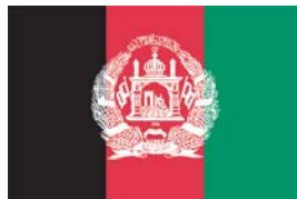
The National Flag of Afghanistan

More reading questions are in the back of the book and at www.uncw.edu/commonreading/