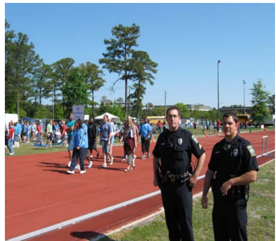
Participants walk the track during Opening Ceremony.